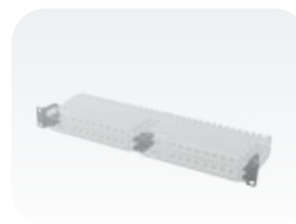
Rackmount kit K-79