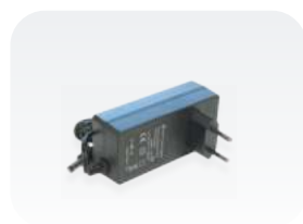
24 V 1.5 A power adapter