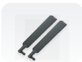
HGO indoor antenna kit